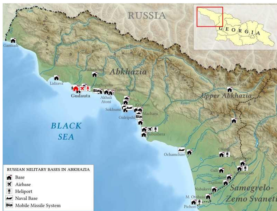
Fig.1- The Russian Federation Military bases in Abkhazia (2011-2016)

Immediately after the recognition of Abkhazian's independence, plans were announced to establish the Russian naval base at the port of Ochamchira, which in Soviet times hosted border guard ships and naval ships training detachment. After coastal infrastructure restoration, the port was able to host permanently from three to five small warships of Russia's Black Sea Fleet (these may include small-size missile or antisubmarine ships, or missile boats), ten patrol ships and boats of the Russian Coast Guard. Such a force would reliably defend the Abkhazian coast.